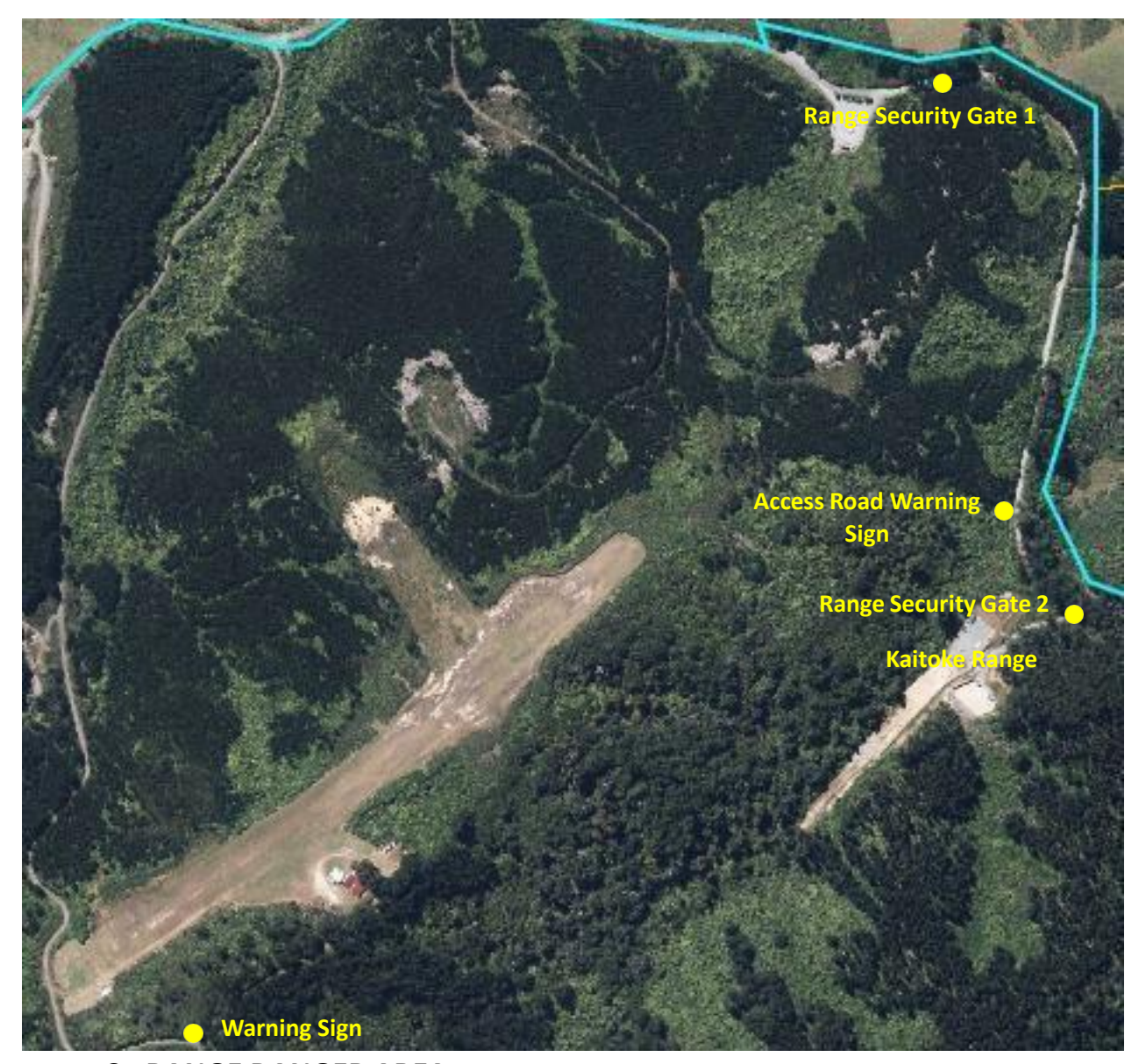
C - RANGE DANGER AREA